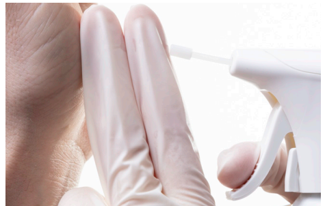
2-3 centimetres from the condyloma

3. Spray at a distance of 2-3 centimetres from the condyloma, for up to 6 seconds. A film of white ice crystals will now form in the treated area. After (up to) 30 seconds, the ice crystals are no longer white, indicating that the thawing period has ended. The first freeze-thaw cycle is now completed.